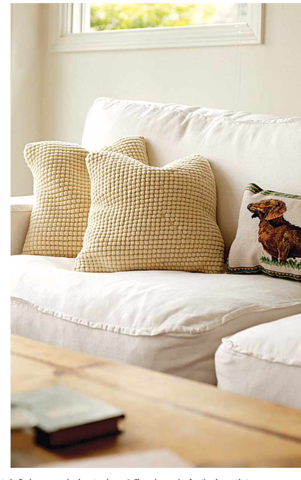
(Opposite) 1. Even Smudge the cat complements the finely woven rug he chose to relax on. 2. The main room is a functional space that combines the living, dining and kitchen areas where visitors can take in breathtaking views of the coastline. 3. Illustrated books and wooden games add a decorative element to the coffee table. 4. The detail on this needlepoint pillow honors Doreen's respect for handcrafted items. 5. Jars filled with bath salts, pumice stones and French milled stones add elegance to a bathroom.

STYLED BY JACQUELINE deMONTRAVEL SEE SHOPPING GUIDE, PAGE 90.